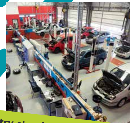
Industry standard facilities for your chosen career