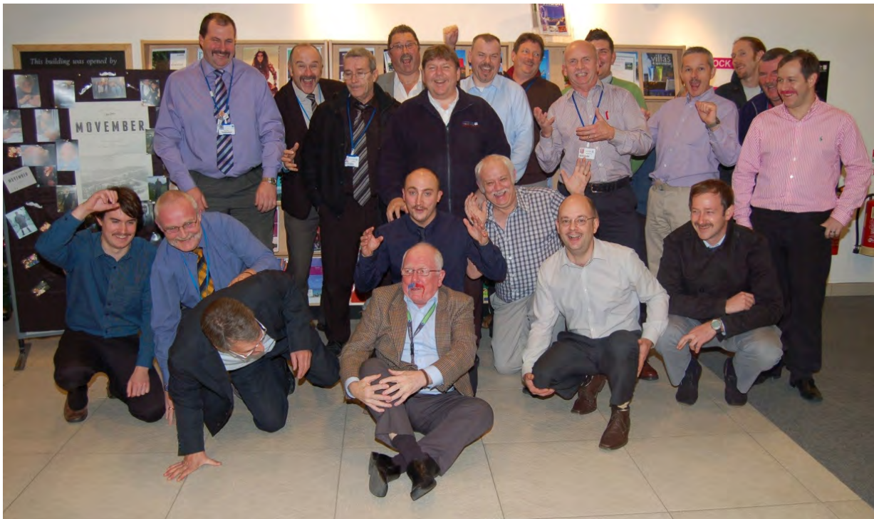
The CRC Mo Bros raising money for Movember

Thirty-six members of staff from around the college, including construction, business, student support and catering, took part in the month-long event, raising over £1,600 for prostate and testicular cancer.